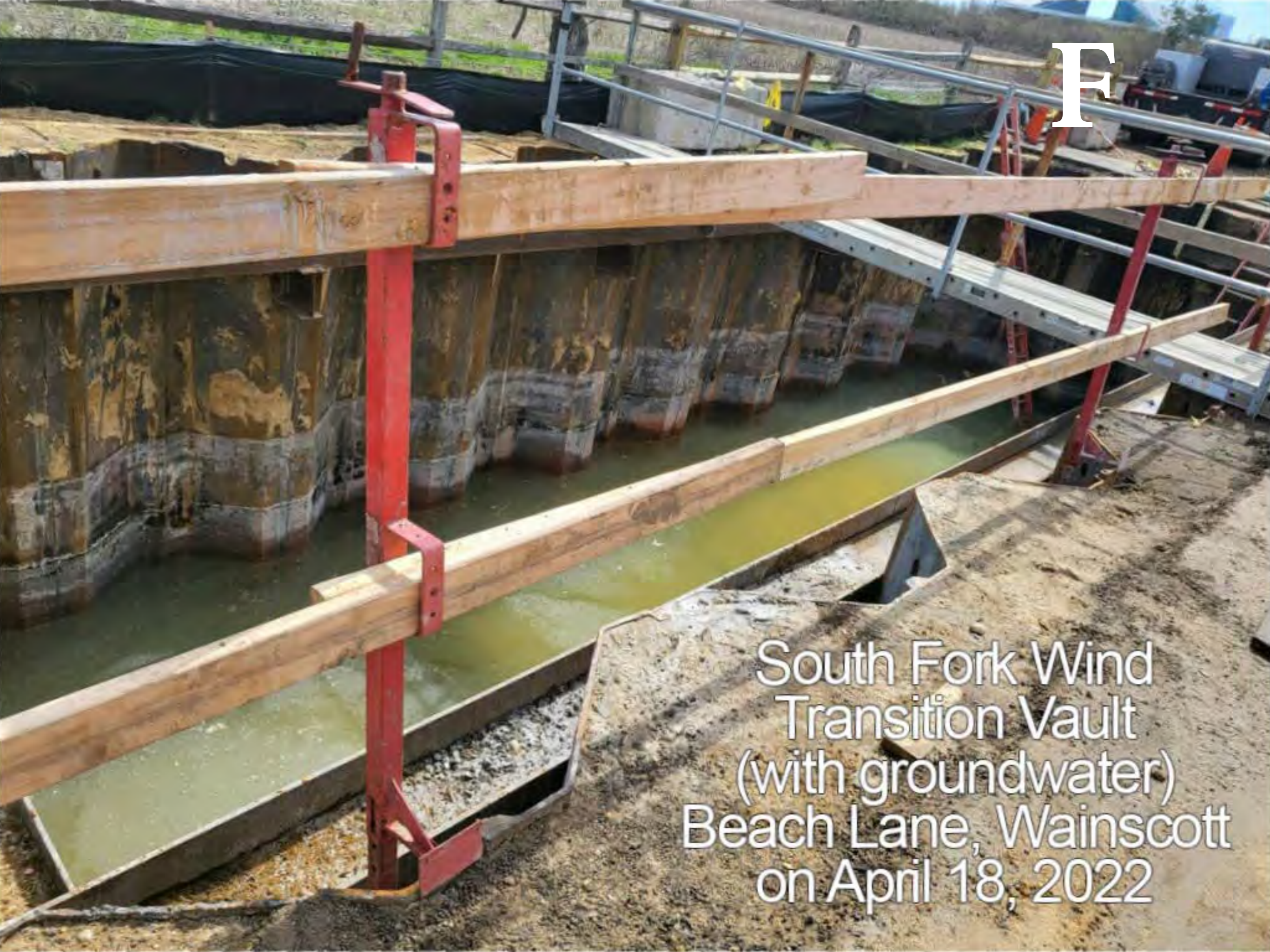
South Fork Wind Transition Vault (with groundwater) Beach Lane, Wainscott on April 18, 2022