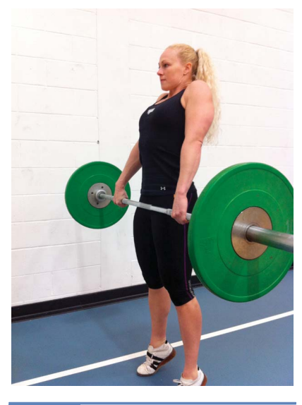
Figure 4. Finished pull with complete extension using clean grip.

outward during the concentric portion of the lift. Prematurely bending of the elbow (humeroulnar) joints prevent the shrug from being fully maximized.