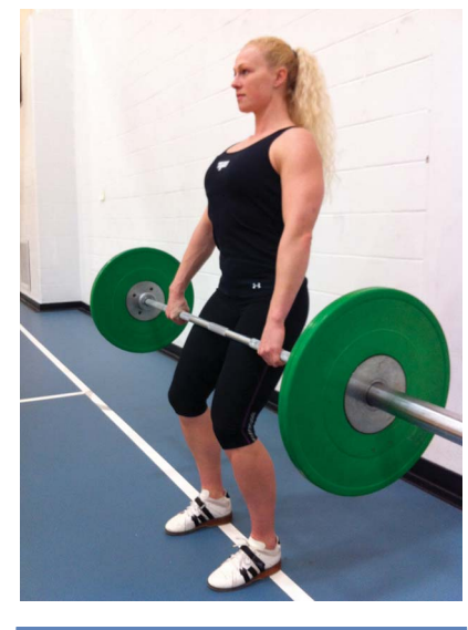
Figure 3. Midthigh (power) position of clean grip pull from floor.

• The path of the bar is only ready to move upward once the shoulder, hips, and heels are inline. Of note, this power position is optimized by a flexed knee angle ranging between 120° and 135°.