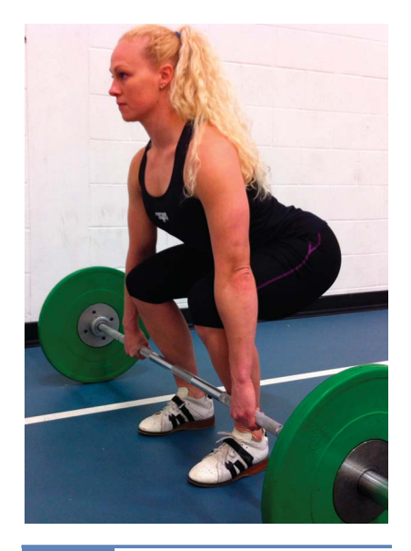
Figure 1. Starting position of pull from floor with clean grip.