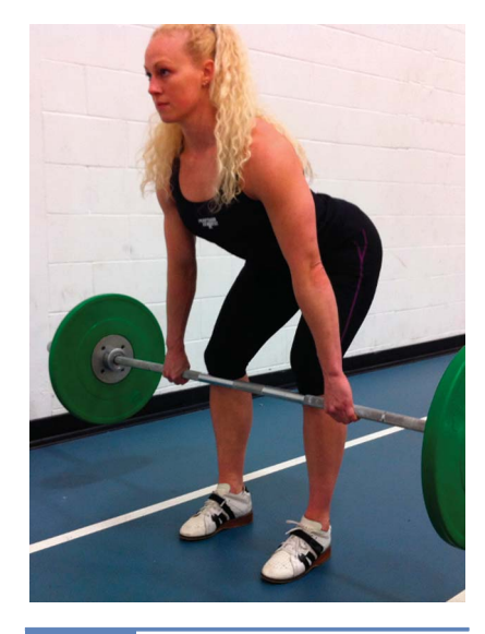
Figure 2. Finish position of first pull from floor with clean grip.

• The athlete may initiate the first pull (off the floor) too forward on the balls of the feet and toes.