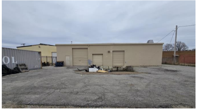
3751 New Getwell Rd. Memphis, TN 38118