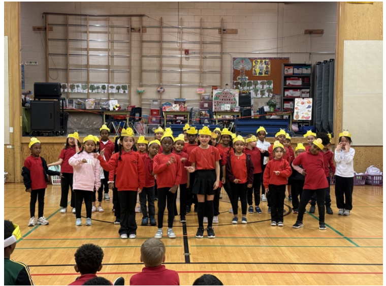
BEE DAY PERFORMANCE AND ROLE PLAY

If you need to continue your children's care at Kidzclub, please update your registration and pay a deposit of $100. The current registration (2025-26) will not be valid in September 2026.