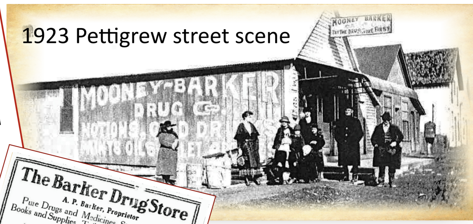
1923 Pettigrew street scene