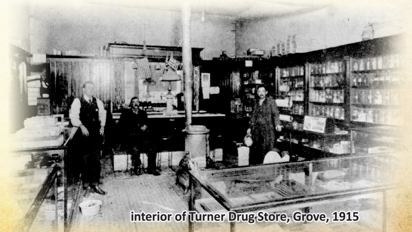
interior of Turner Drug Store, Grove, 1915