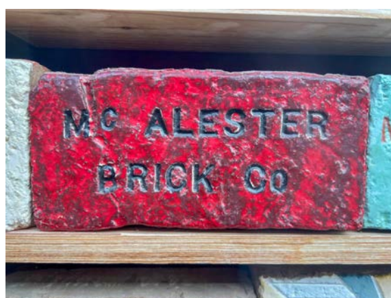
Brick Company Salesman Sample