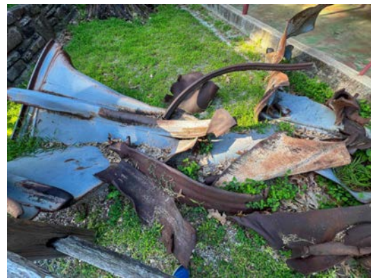
This debris is located across from the Mayor's home, Exhibit 91.