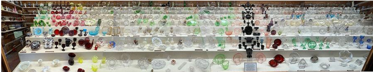
One of over 100 exhibits ~ Carnival & Pattern Glass