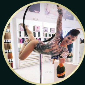
AERIAL POURERS $1,200