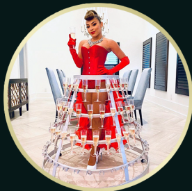
CHANPAGNE SKIRT $999