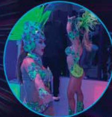
2 Samba Dancers $650

WE ALSO PROVIDE Specialty Stilt Walkers • Fire Performers Hula Hoopers • Jugglers • Aerialists Circus Acts & more!