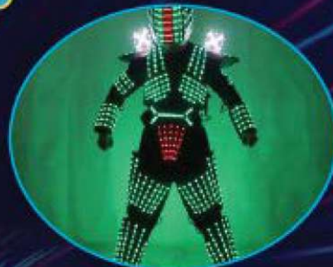
Dancing Robot $350