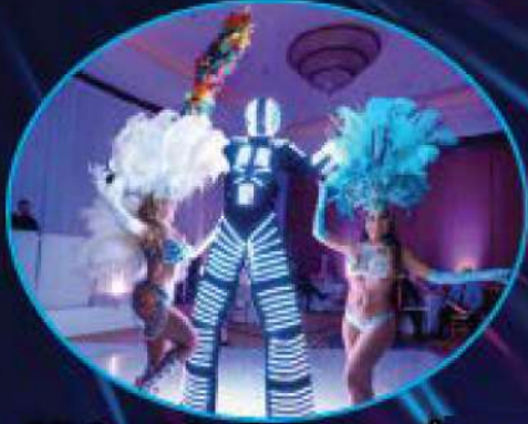
1 Robot, 2 Samba Dancers $1,100