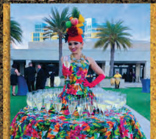
LIVE TABLES $999