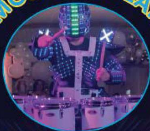
Non-Stilted Robot Drummer $450