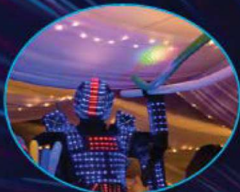
Stilted LED Robot $ 450