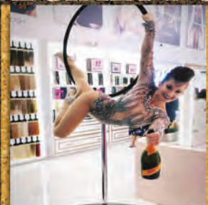
AERIAL POURERS $1200