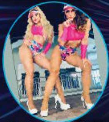
2 Go-Go Dancers $600

WE ALSO PROVIDE Specialty Stilt Walkers • Fire Performers Hula Hoopers • Jugglers • Aerialists Circus Acts & more!