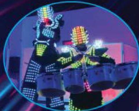
2 LED Robots $900