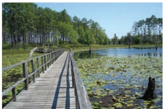
Lake Seminole Park