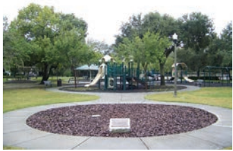
Seminole City Park