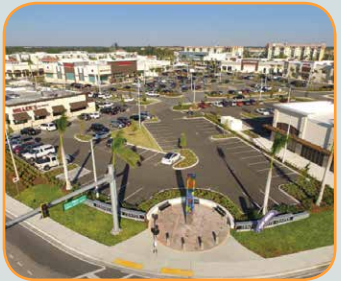
Seminole City Center