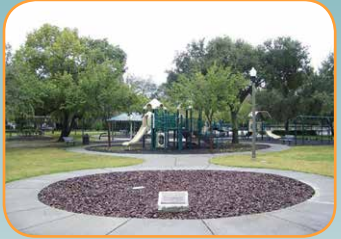
Seminole City Park