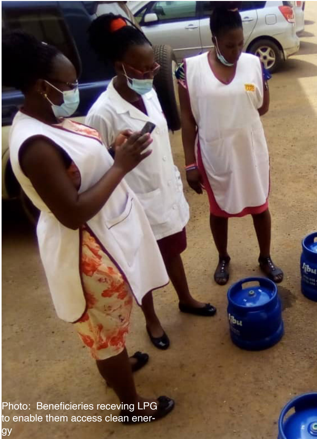
Photo: Beneficiaries receiving LPG to enable them access clean energy

Most surveys conducted in the off grid communities report that access to electricity is a top priority for refugees, and our efforts are making a real difference in addressing this need.