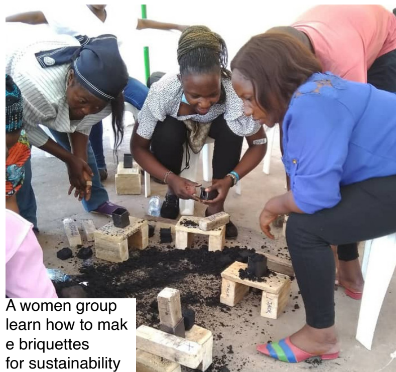
A women group learn how to make briquettes for sustainability

We believe that promoting gender equality is not only a matter of social justice but also a key driver of sustainable development. By providing equal opportunities for men and women, we are working towards creating a more inclusive and prosperous society. RGF remains committed to promoting gender equality in all our programs and activities.