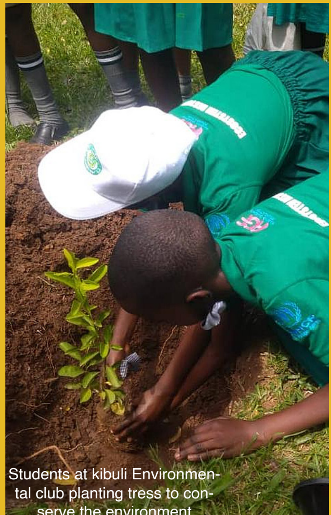
Students at kibuli Environmental club planting trees to conserve the environment

By increasing access to sustainable energy, vulnerable households can improve their health and well-being, access better education and job opportunities, and contribute to sustainable environmental practices. As RGF continues its efforts to boost livelihoods in marginalized communities, access to sustainable energy will remain a crucial component of its programs.