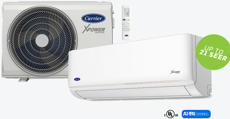
CARRIER INVERTER VS LOW SEER TRADITIONAL SYSTEM