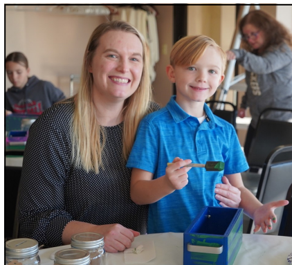
2nd Grade Milestone "Kids & Money" The student & parent class project was Give/Save/Spend.