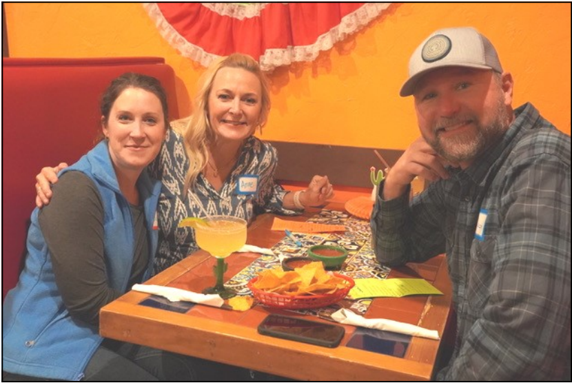
Fiesta Night for parents of PreK-HS youth was held in October! This was also one of the events that the Lead team planned.