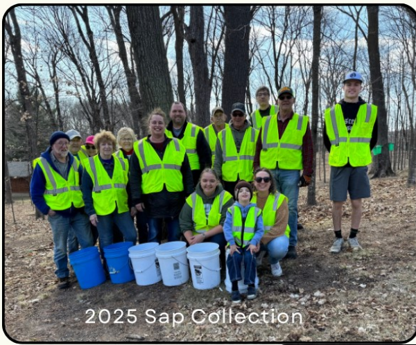
2025 Sap Collection