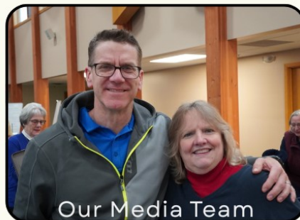
Our Media Team