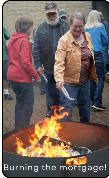
Burning the mortgage!