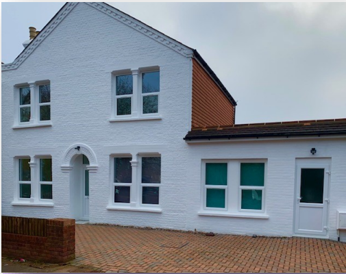
Southwood Road Home