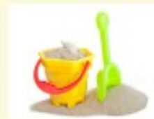
buckets and spades