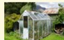
green house - liaise with office before

If you are interested to help with your time and effort, please email the School office office@hujjatprimary.org , and let us know if you are available on any or all of the Saturdays: 14 th June; 21 st June; 5 th July