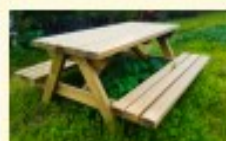
outdoor picnic benches - liaise with office before