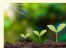
plants (which can be potted)