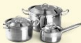
pot and pans