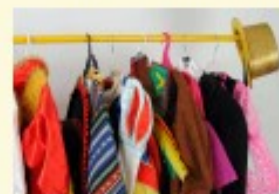
dress up costumes