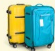
suitcases (with wheels)