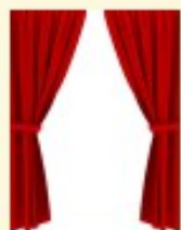
water proof curtains