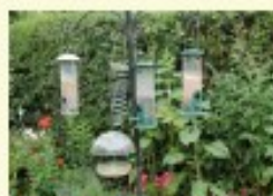
bird feeder; bird baths; bird table