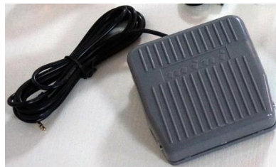
Single switch foot pedal