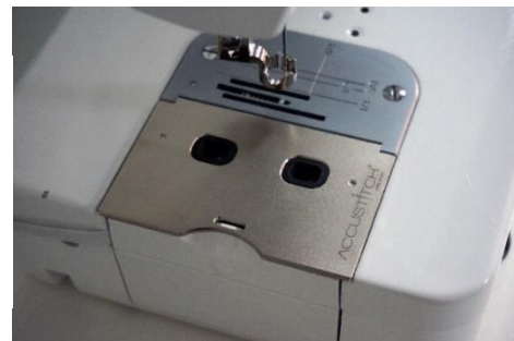
Accustitch installed correctly