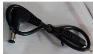
Foot pedal adapter cord