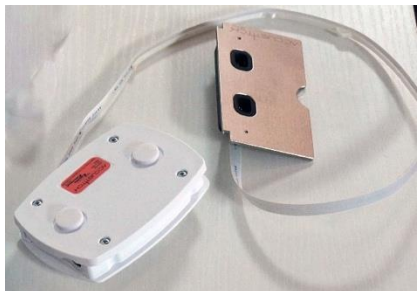
Photo sensor Accustitch regulator plate and Motion controller

The Accustitch kit for domestic sewing machines box includes the following parts: