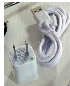
USB power adapter and USB power cord