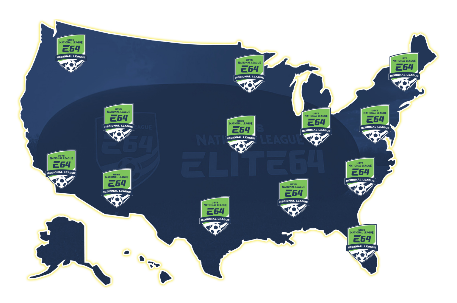
For 2023-24, the E64 Regional League is currently running in the Midwest & Great Lakes regions. The above map shows projected leagues to roll out for the 2024-25 season.