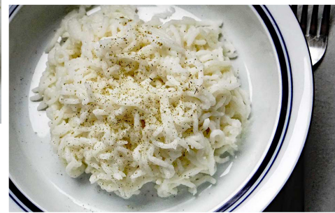
Shaped Rice Granules