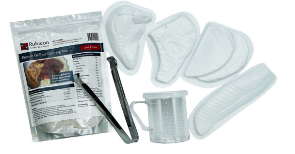
Grilled pork chop

*For thicker consistency, increase the amount of shaping mix an extra \frac{1}{2} T per serving.