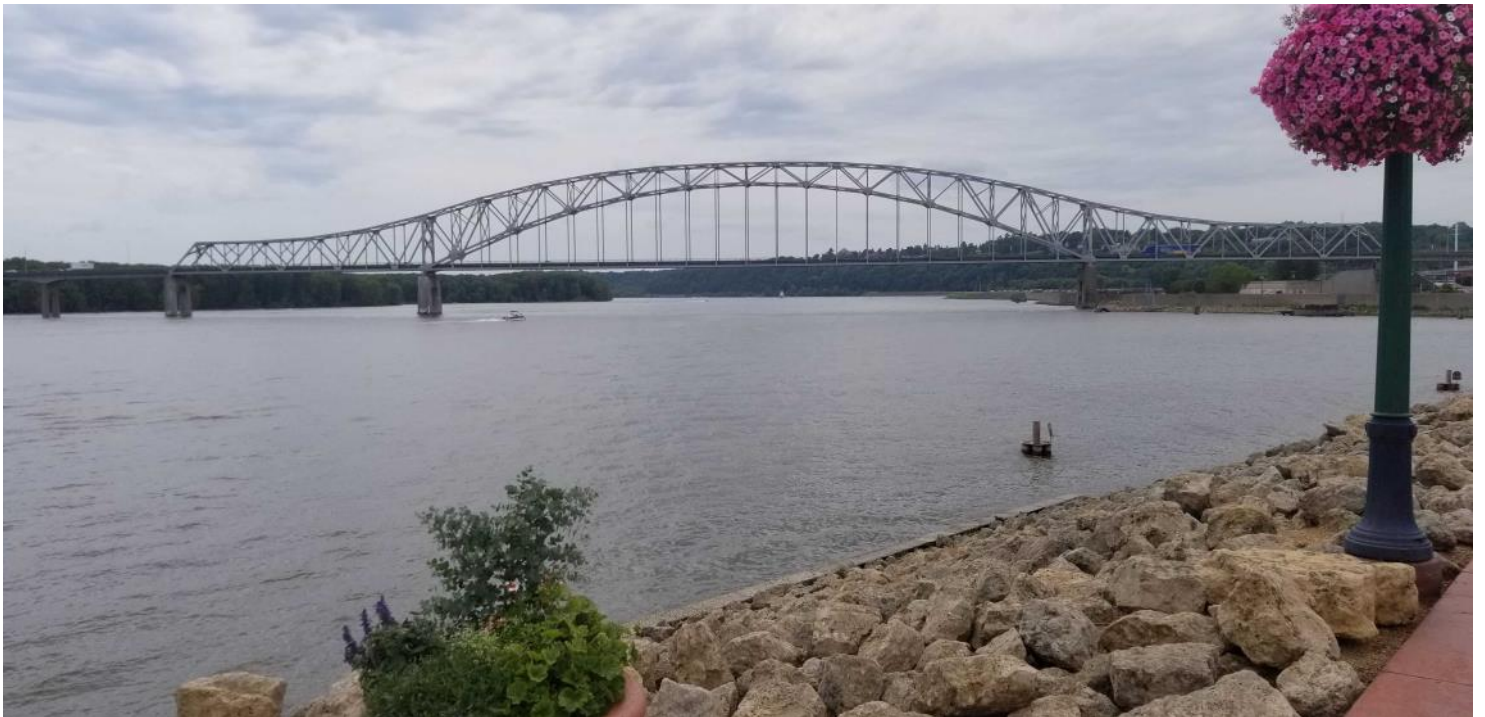
The view of the Mississippi from the Riverwalk, next to the car show field

There are four MG registers that each have their own events. They are NAMGAR for MGAs, NAMGBR for MGBs, NEMGTR for the T-series and NAMMMR for the prewar MGs. Every 5 years, they join together and hold a combined event. The last one was MG2016 in Louisville, Kentucky. That means that the next joint event will be GT-46/MG2021. It has now been announced that this will be held in Atlantic City, NJ! We have a while to plan, of course, but we should all consider attending such a big MG event in our own backyard. More information on both the Colorado and Atlantic City events will be available on the NAMGAR website: www.namgar.org .