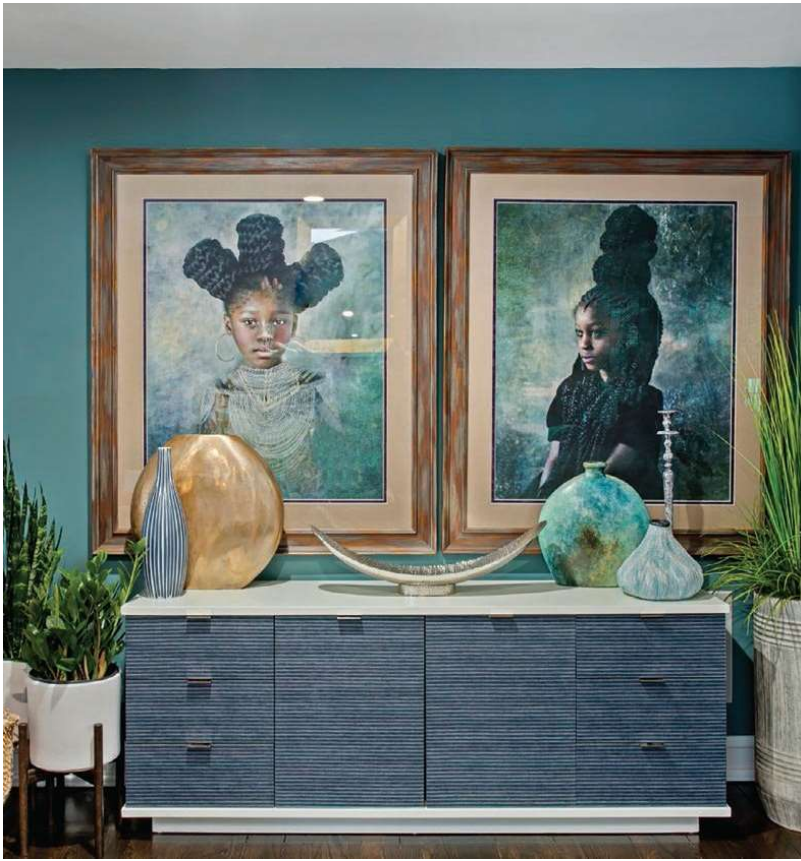
A Long Island, N.Y., home by Kimberly + Cameron Interiors. PHOTO... »