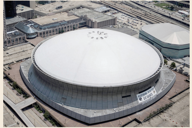
Mercedes-Benz Superdome

Roofing system guide specifications are available for new construction and roof restoration projects over most substrates.