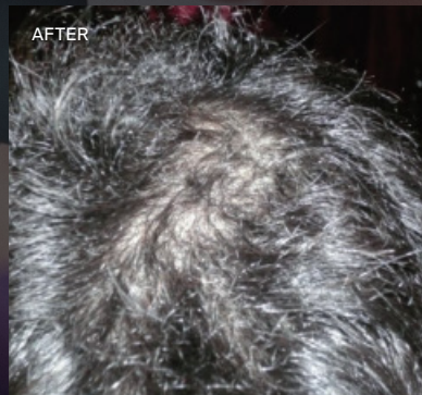
Figure 2. Female - 8 sessions microboluses techniques