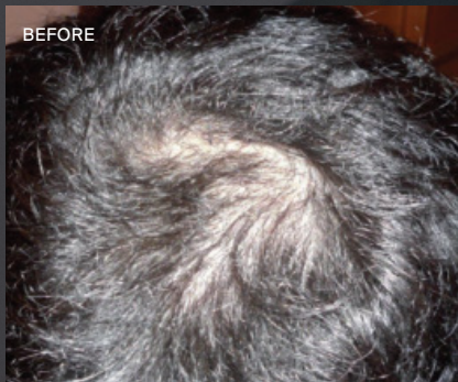
Figure 1. Male - 8 sessions microboluses techniques

Best results are noticeable after a course of treatments.