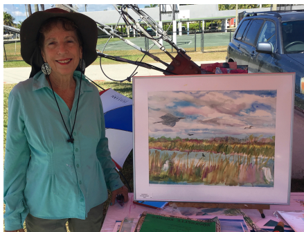
One of many vendors displaying her artwork