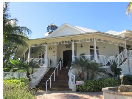
MSD Opening Ceremony Hosted at Everglades Isle Resort

The Museum is located at 105 West Broadway, Everglades City, telephone (239) 695-0008