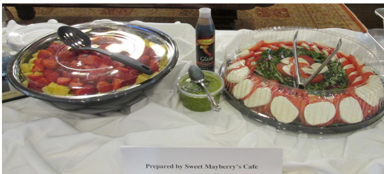
A Taste of the Good Life was Provided by Sweet Mayberry's at the Opening Ceremony Luncheon for the 2017 MSD Festival

The Museum is located at 105 West Broadway, Everglades City, telephone (239) 695-0008 Open to the public Monday through Saturday, 9 am to 4pm