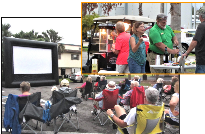
Now that the days are long, we saw our last Movie Night "under the stars" in March. The Friends served popcorn and refreshments before the show started.

May, June, July: Artwork from Everglades City School