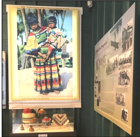
The new Seminole window and cabinet. See Manager's Report, page 2.