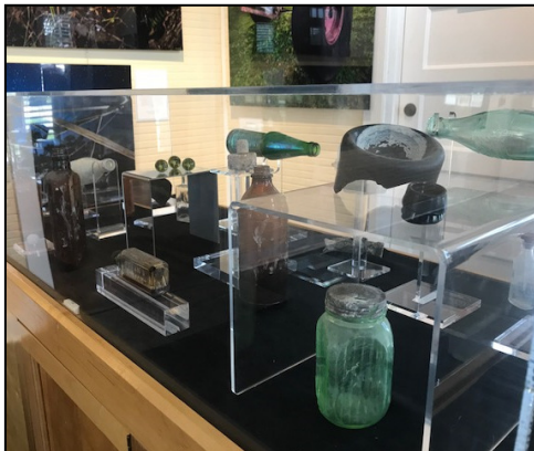
Some of the old bottles and other items found in the wilderness by Tod Dahlke of "Tour the Glades".