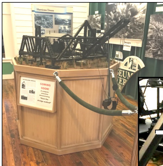
The Walking Dredge display on its new pedestal – notice the little figure of a man operating the controls ( inset ). The original dredge, which you can visit at Collier-Seminole State Park (US-41 & SR-92, road to Marco Island), is really huge! See Manager's Report on page 2.

Skunk Apes, Scallywags, & Swamp Spirits Legends and Lore of the Everglades