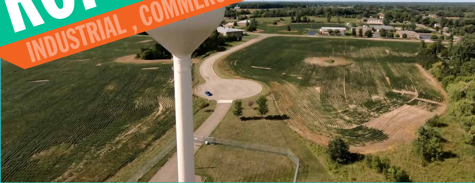
LAPEER INDUSTRIAL PARK