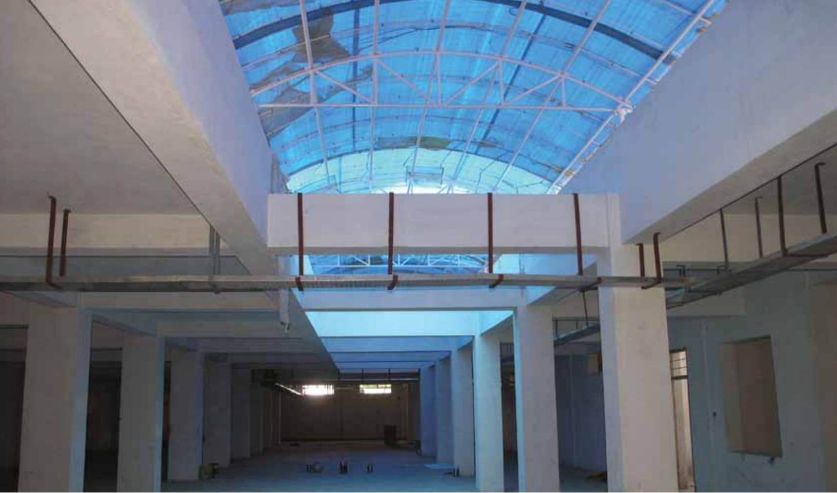
CELLAR, OPEN TO THE SKY