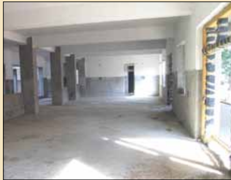
WAITING LOUNGE AREA

Multiple seating areas for patients and their families with a reception/help desk.