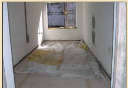
EKG, MOBILE X-RAY ROOM