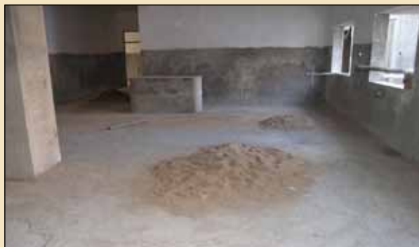
TRIAGE WITH 11 BEDS