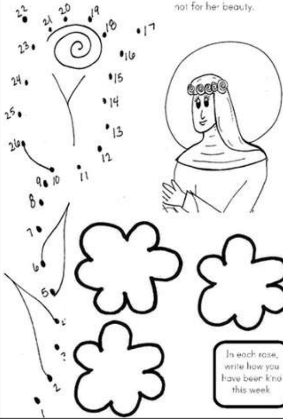
Year C, Nineteenth Sunday of Ordinary Time

Saint Rose of Lima was very pretty so people called her a rose. She wanted to be known for her kindness and faith, not for her beauty.