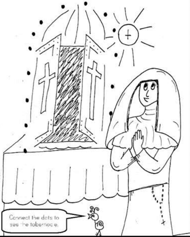
Year C, Third Sunday of Easter

Blessed Imelda Lambertini wanted to receive Holy Eucharist, but she was too young. She knelt by the tabernacle and prayed that God would let her receive communion. The Eucharist miraculously floated out of the tabernacle for her First Communion!