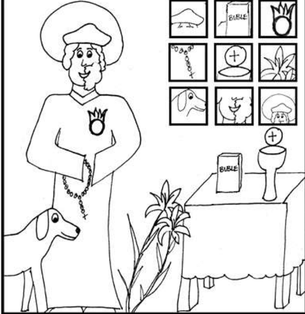
Year C, Fourth Sunday of Easter

Saint Philip Neri wanted to teach a man to be humble so he asked him to "walk a dog" by carrying the dog around all day.