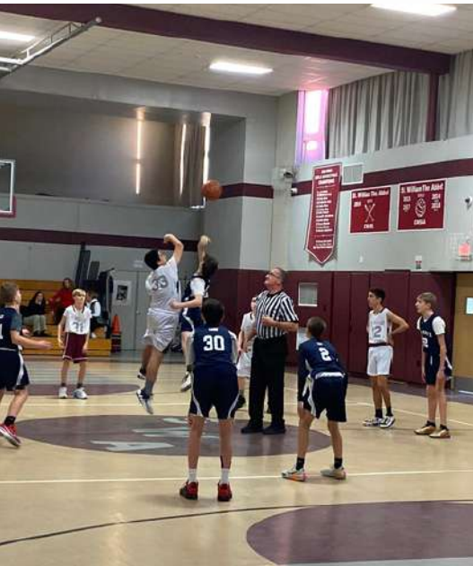
Our 8th Grade Boys took on St. Mary's