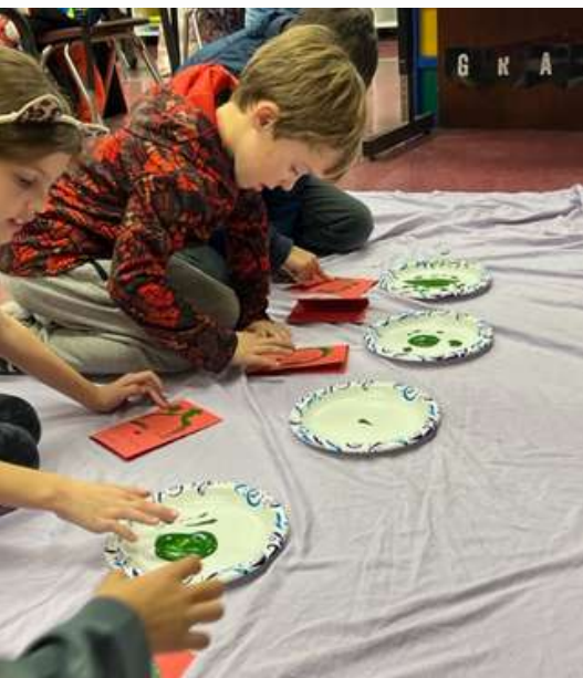
2nd Graders made birthday cards for Baby Jesus in Faith Formation