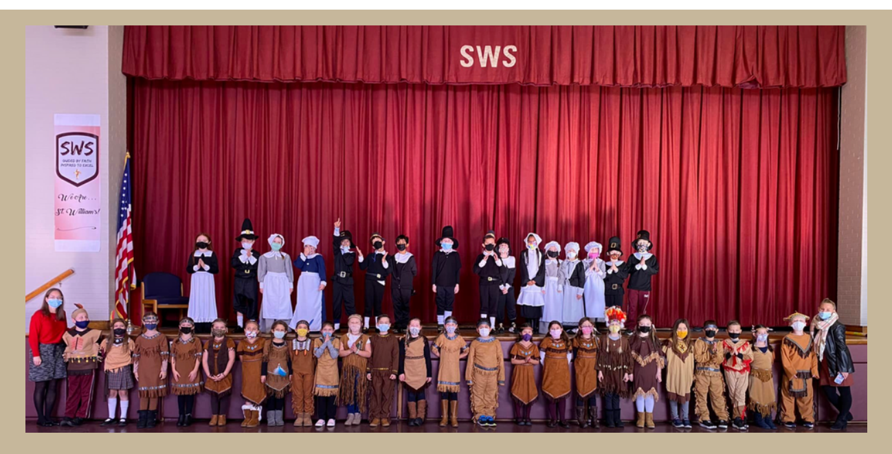
Our 3rd graders were wonderful, leading the church with song. Happy Thanksgiving! #SWStradition #wearestwilliams