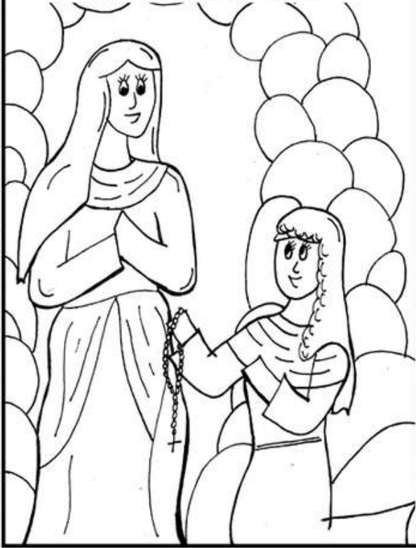
Year A, Fifth Sunday in Ordinary Time

Mary appeared to Saint Bernadette and asked her to wash in the stream. Bernadette couldn't find a stream. She dug in the dirt until she found a trickle of water. That water became a huge stream! Miracles happen when people wash in the stream.