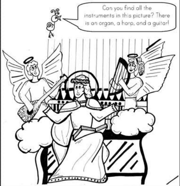
Year C. Solemnity of Our Lord Jesus Christ, King of the Universe

When you sing, pray to God and tell Him that you love Him!