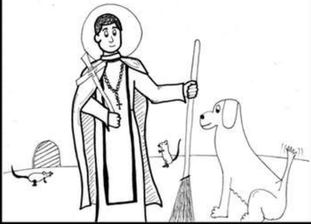
Year C: Thirty-second Sunday in Ordinary Time

Pray to Saint Martin instead of complaining when it is time to clean your room.