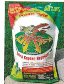
Chase Gopher, Mole & Armadillo Control