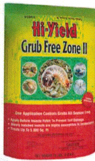
Grub Free Zone II (Grub Control) May