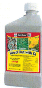
Weed Out w/Q Controls Grassy & Broadleaf Weeds For: Bermuda Lawns ONLY