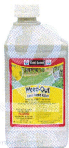
Weed Out Controls Broadleaf Weeds / For: St. Augustine & Bermuda Lawns