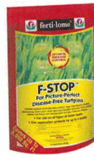
F-Stop (Lawn Fungus Control) Spring & Fall