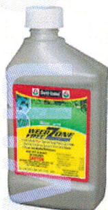
Weed Free Zone: St. Augustine & Bermuda Gras A Cool Weather BroadLeaf Weed Control