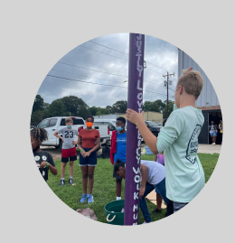
Faith-Based Inclusive and affirming. Loving all neighbors is the work of Christ.

Collaborates and partners with other organizations to meet and address needs.