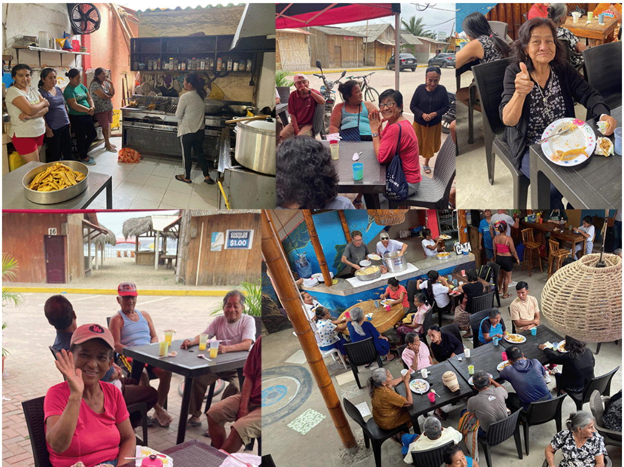
Scenes from the First Lunch at the New Venue

In Olon, Ecuador, our cherished weekly senior lunch program has found a new home so we can continue serving over 100 nourishing meals each week to our beloved seniors.