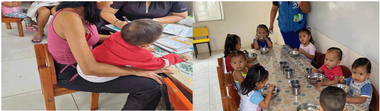
Nap Time--Lessons in Teeth Brushing--Wellness Checks--New Tables and Chairs