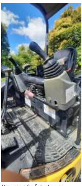
Yanmar Safety Lever Down Position