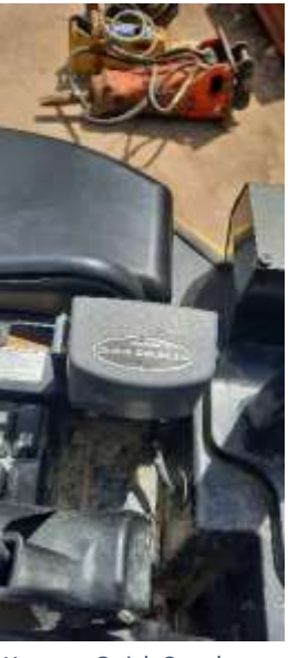
Yanmar Quick Coupler Grey Box