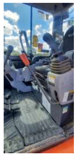
Kubota Safety Lever Down Position