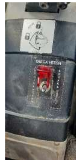
Komatsu Quick Hitch Switch