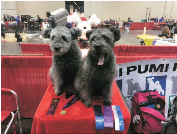
ZsaZsa & Lila (BlueRidgeVista Csilag FDC CGC)