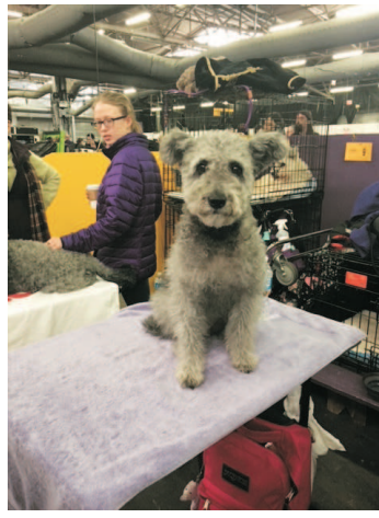
ZsaZsa GCH CH BlueRidgeVista Abrams CM NA NF FDC CGCA