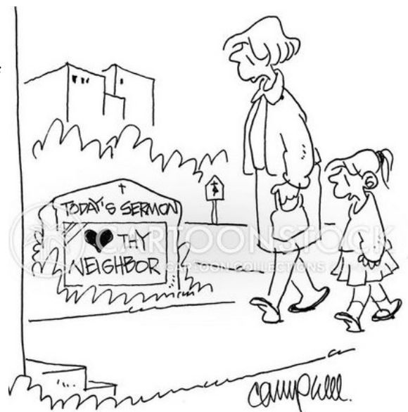
"Look, Mom. A Valentine theme."