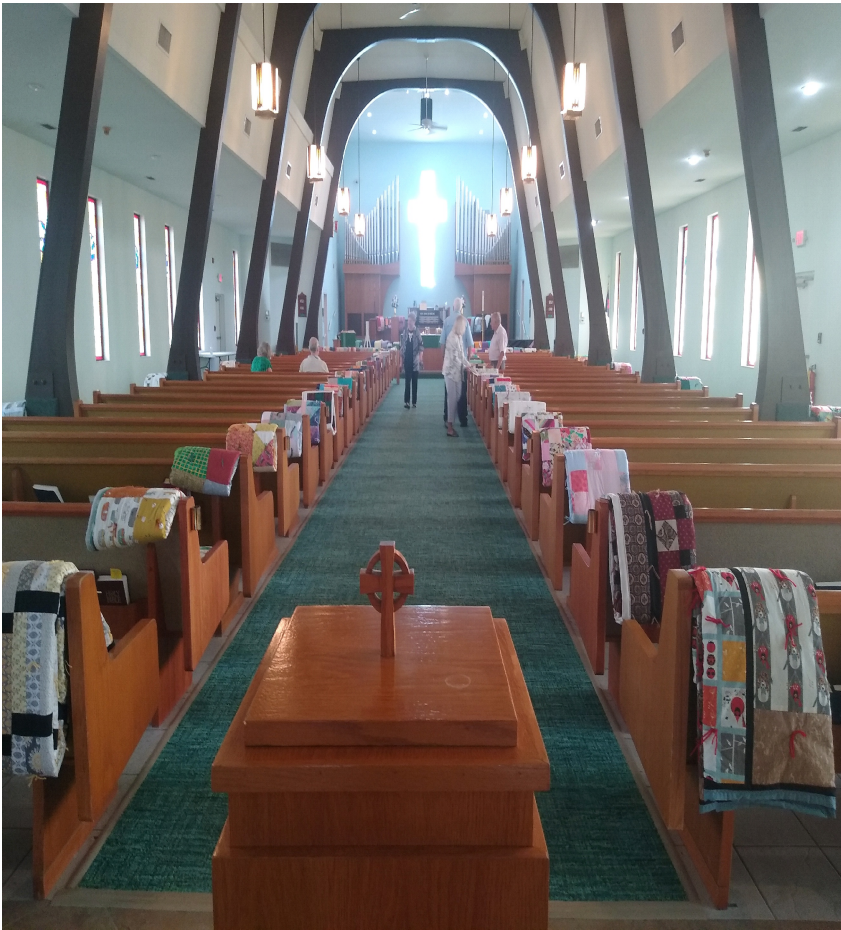
80 Quilts for the Lutheran World Relief