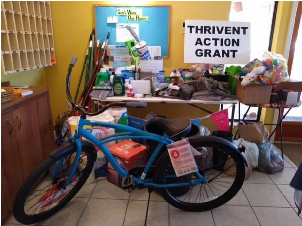
Thrivent Action Grant "Starting Anew"

Thanks to the Congregation for their overwhelming support for our Thrivent Action Team to help the Sarasota County Sherriff's Homeless Project.