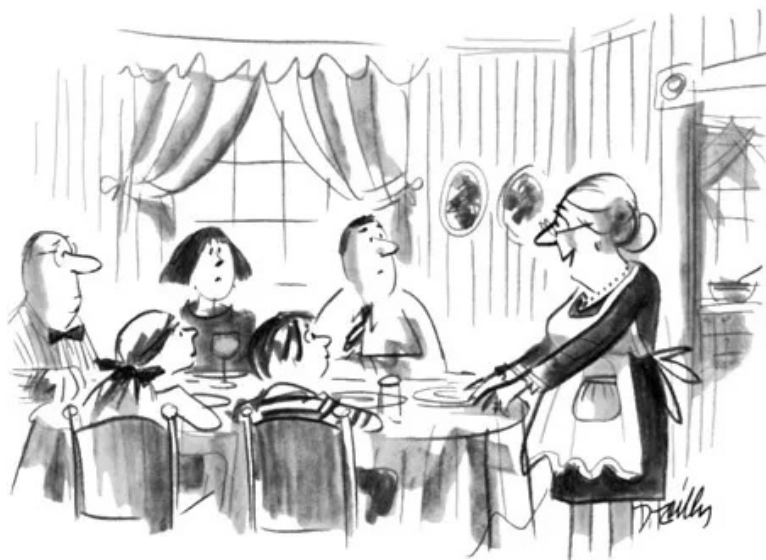
"Thank you all for coming. Starting next year, Mother's Days will find me at the Desert Palm Spa."

FOR EACH MEMBER IN YOUR HOUSEHOLD. THE INFORMATION IN THE SURVEY IS A VERY VALUABLE TOOL TO CHRIST LUTHERAN CHURCH. IT ALLOWS US TO KNOW WHICH OF OUR MEMBERS WOULD BE GOOD ON WHICH COMMITTEES, WHO IS WILLING TO SERVE IN WHICH AREAS, AND WHICH OF OUR MEMBERS HAVE TALENTS THAT CAN BE SHARED WITH THE CHURCH. THIS MAY INVOLVE EDUCATION, TRAINING, AND PRACTICE IN VARIOUS FIELDS, ALWAYS WITH THE INTENT OF GLORIFYING GOD. IT'S BEEN MANY YEARS SINCE WE DID OUR LAST SURVEY AND IT IS IMPORTANT TO HAVE UP-TO-DATE INFORMATION ABOUT THE GIFTS GOD HAS GIVEN TO EACH OF US TO USE FOR HIS GLORY. AS EACH HAS RECEIVED A GIFT, USE IT TO SERVE ONE ANOTHER, AS GOOD STEWARDS OF GOD'S VARIED GRACE. THIS SURVEY CAN BE PICKED UP IN THE NARTHEX AND RETURNED AT YOUR EARLIEST CONVENIENCE. FORMS ARE AVAILABLE IN THE CHURCH OFFICE. THANK YOU!