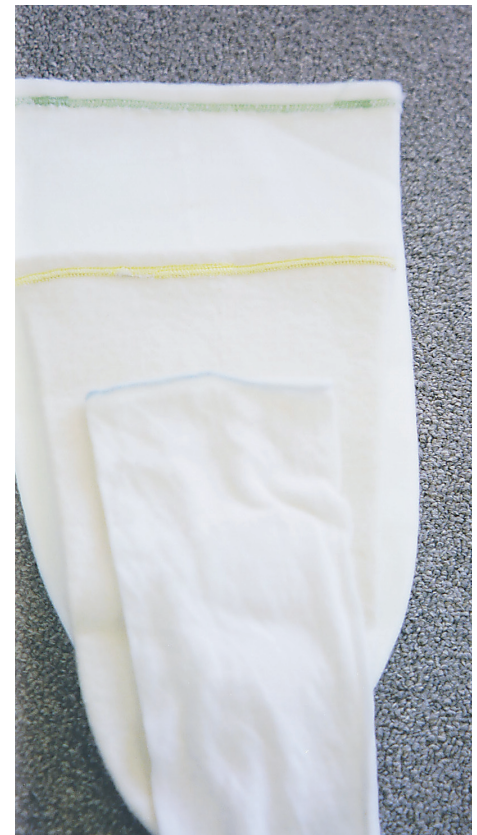
Different ply of prosthetic socks: Top: 5-ply Middle: 3-ply Bottom: 1-ply

All amputees are aware that the size of their residual limb changes over time. Most experience subtle, and sometimes not so subtle, changes in volume over the course of a single day. Factors that affect the volume of the limb include reduction of postoperative edema, muscle atrophy, changes in body weight and the temporary reduction of fluids in the limb caused by the normal pumping action of walking in a prosthesis. To maintain an even, comfortable fit, it is necessary to accommodate for these volume changes by adjusting the thickness of the prosthetic socks. This can be done either by changing to a thicker sock, i.e., from a 3-ply to a 5-ply, or by adding another 1- or 2-ply sock over the existing sock. Care must be taken not to overdo this. If too many socks are used, the socket will not fit properly and may cause discomfort and skin breakdown.