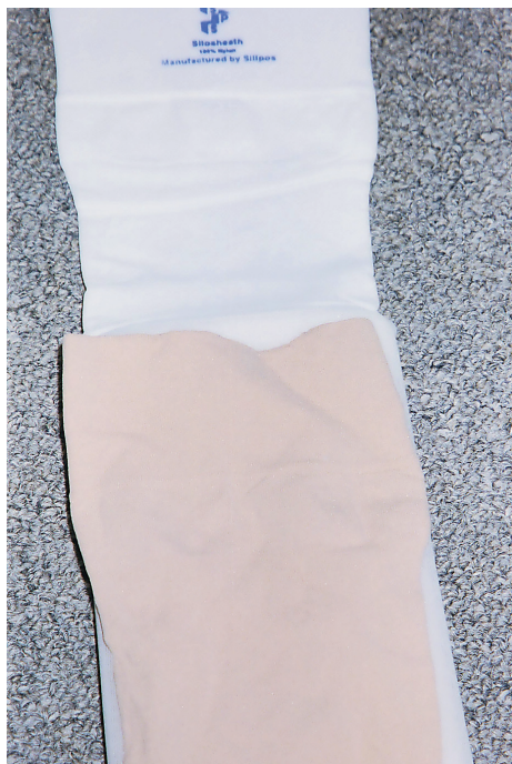
Nylon sheaths come in white and flesh.

Nylon sheaths perform the valuable function of providing a moisture barrier and controlling friction between the skin, the sock and the prosthesis. Sheaths look like hosiery but are specially constructed at the distal end to offer maximum smoothness. The top and toe are reinforced so that pulling taut is possible; however, leaving a little slack is advised to prevent stressing the sheath. Sheaths are generally worn in combination with a thicker sock, creating a prosthetic sock system.