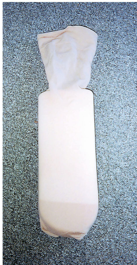
Flesh-colored nylon sheath with silicone insert.

Socks and sheaths are also available with gel attached to, or sandwiched between, the fabrics. The gel is usually made of silicone and provides excellent cushioning, pressure distribution and reduced friction. The thickness and stiffness of the gel will dictate the cushioning qualities of the sock. Because gel tends to flow from areas of high pressure to areas of lower pressure within the socket, maintenance of a more even pressure distribution is possible. If the sock or sheath is constructed with the gel exposed, the gel should be worn against the skin. This will help protect the skin from the friction forces created during walking, since the motion will tend to occur between the gel sheath and the prosthesis rather than between the gel and the skin.