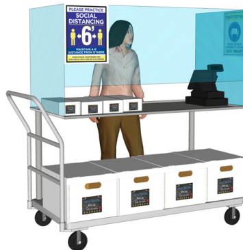
Portable POS/ Utility Cart For Food Transporting And Manual Serving

Unload Classroom Boxes Onto Your Portable Utility Cart (Mounted To Your EV) Or Your Portable POS Station (Stored At The Classroom Bldg)